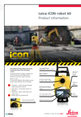
Leica iCON robot 60 datasheet

Copyright Leica Geosystems AG, 9435 Heerbrugg, Switzerland. All rights reserved. Printed in Switzerland – 2018. Leica Geosystems AG is part of Hexagon AB. 870464en – 01.18