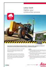
Leica ConX flyer

Leica Geosystems AG Heinrich-Wild-Strasse 9435 Heerbrugg, Switzerland +41 71 727 31 31