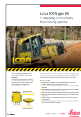
Leica iCON gps 80 datasheet